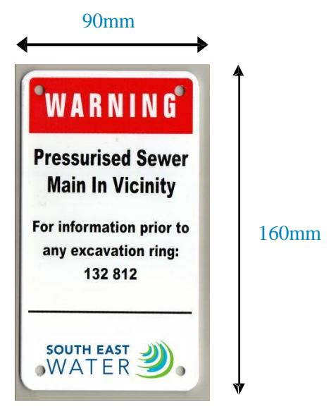
Fig 1: Sign for attachment to posts

The sign is to be connected to the post using self-tapping stainless steel screws.